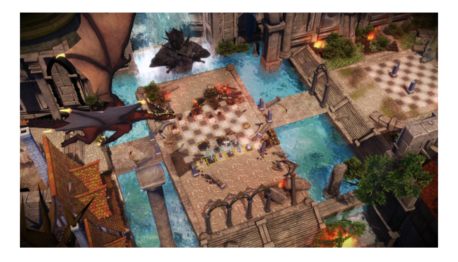
Unsung Warriors - Prologue Download Setup